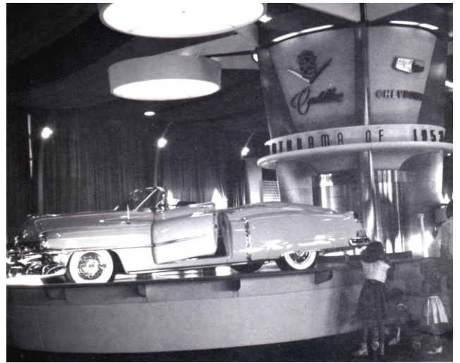
Five-car display stand, one turntable for each GM marque; display built and torn down at each Motorama site

At the end of June after its second Motorama in Kansas City, Cadillac called FW 6 back from show service (see Return for Credit Notice below). Then on August 18 it was invoiced from the factory for public sale and sent to an illegible destination. Here's where the story shifts continents.