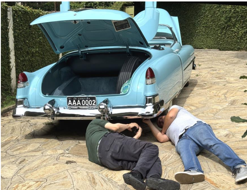
Interviewing Eldorado #6