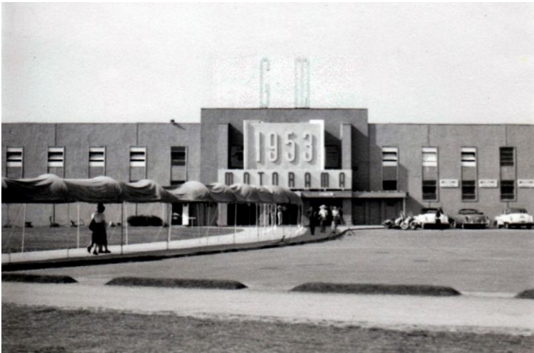
Entrance to Fair Park exhibition hall; two Buicks and a Cadillac parked out front; what kept the "GM" from tipping off the roof in a wind?