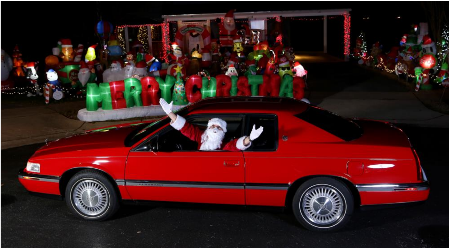
Santa and his red '92 Eldo appear in the 2025 CLC Museum & Research Center calendar

This 1992 Crimson Red example is a base Eldorado, with just the basic options: floor mounted console automatic, A/C, AM-FM cassette stereo, cruise control, and 30 spoke wheels (which look great, but require extensive cleaning).