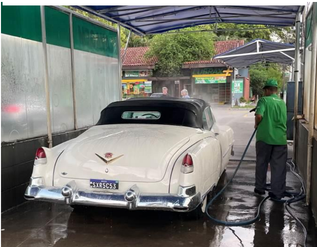
The Car Wash: Going in by day (below left), Coming out by night (below right)

Have a look at the Eldorado #25 gallery.