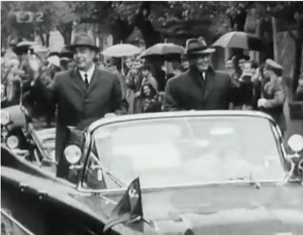
Above: Screenshot - Leonid Brezhnev (l.), Marshal Tito (r.) Hammer & Sickle on Cadillac Fender, Belgrade, 1960

They might be the bad guys, but it doesn't matter. They are celebrities. In 1960, not one, but two heads of state from the "evil empire" rode in a Ghia-bodied Cadillac convertible limousine in a motorcade through Belgrade . They were Marshal Josip Tito, President of Yugoslavia, and Leonid Brezhnev, Chairman of the Presidium of the Supreme Soviet of the USSR. How come they were riding in a Cadillac instead of a ZIM or a ZIL? Because it was a gift from the United States. Incredibly, Ike gave Tito the Cadillac, possibly the last 1960 Series 75!