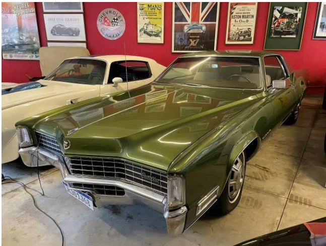
Left: 1968 Eldorado, 2nd front-wheel-drive Cadillac