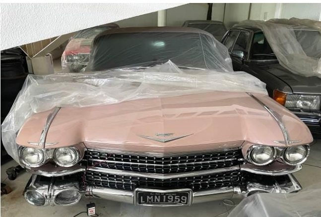
Left: 1959 Series 62 Coupe - All pink inside and out