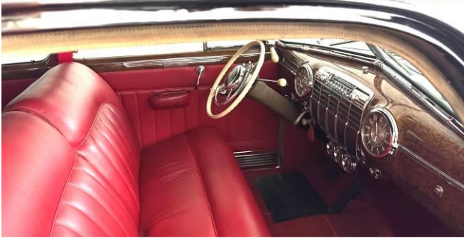
1941 Series 62 Four-Passenger Coupe, Interior and exterior with 2nd year Hydramatic transmission