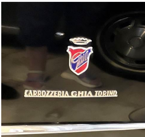
Tito's Cadillac today in the "Santa Thereza" Collection, Rio de Janeiro