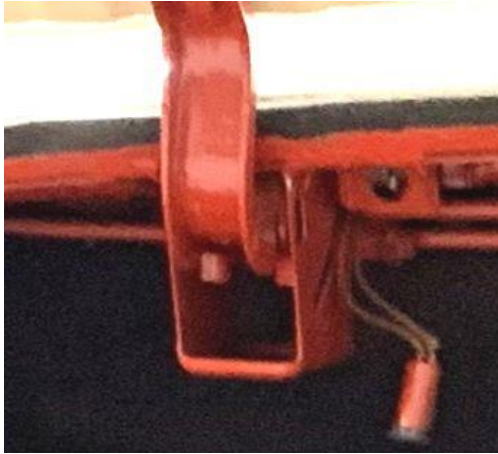
Left: Original hinge arrangement on Eldorado #2