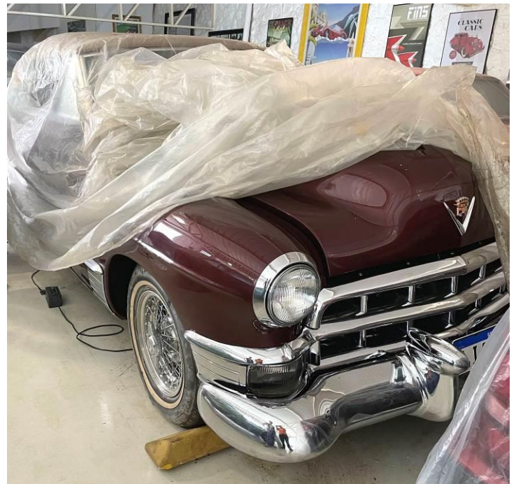
Above: 1949 Convertible with rare knock-off wheels like on the supercharged '53 Eldorado