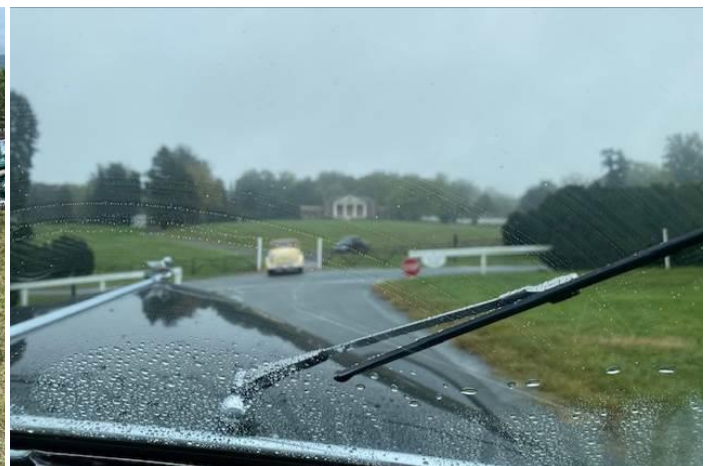
Our rainy entry into Montpelier, President James Madison's estate