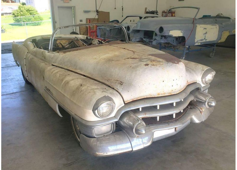
Eldorado #533, last 1953 Eldorado issued by the Fleetwood Fisher Plant, undergoing restoration at Cole's Classics in Ohio; See "Eldorado of the Month," Caddie Chronicle , Dec 2023