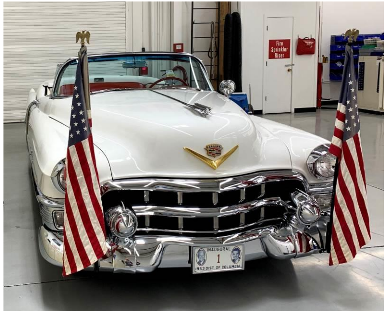
1953 Eldorado #2, Oldest Surviving Eldorado, in Lee Collection, Nevada See The Self-Starter Aug, Oct, Nov 2022 and Jan 2023 issues