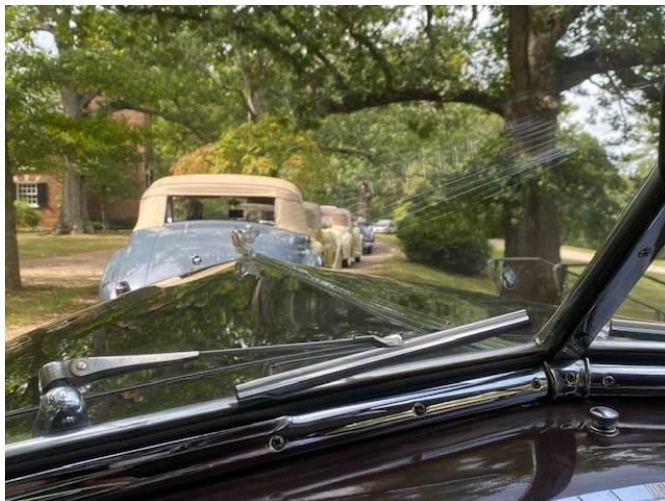
Following the '41 Packard Darrin into Bollingbrook Farm

All told, our tour covered 556 miles, and with our travel to and from the tour HQ, our total mileage was just over 800 miles. The entire tour was on mostly two-lane roads with breathtaking scenery of all the farms and the Blue Ridge Mountains.