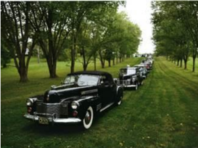
Our '41 leads the procession as the cars approach Ayrshire Farm in Upperville