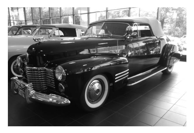
Many collectors consider the 1941 Cadillac to be the most beautiful Cadillac built, and among those hobbyists, the Series 62 convertible coupe is an evergreen favorite.