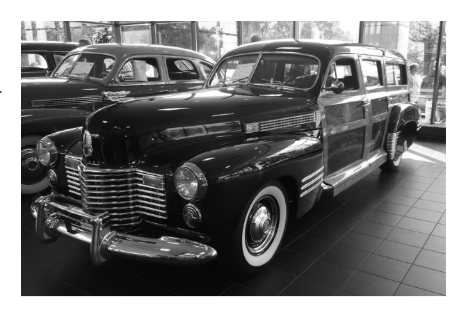
Very few station wagons were built on the Cadillac chassis for 1941, and this wood-bodied example is believed to be one of only a few.