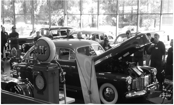
The Potomac Region of the Cadillac & LaSalle Club holds its annual meet inside and around Capitol Cadillac, a well established dealership that sold many of the club cars when they were new.

customer. When Cadillac learned of this audacious encroachment on their turf, they had Curtice stopped. To protect its market, Cadillac offered the Series 67 as a secondary ultra-fine automobile. It was 2-1/2 inches lower than the Series 75 and was mounted on a 3-inch longer wheelbase (139 inches). It was the longest Cadillac at 228 inches. The lower silhouette sans beltline molding proved to be particularly handsome. One of these cars was present at the Potomac Region Show.