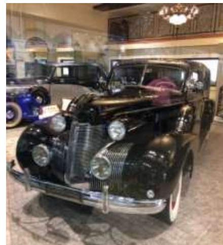
Classic Showroom with a 1936 V-12 Packard and 1939 Cadillac Series 75 Town Car