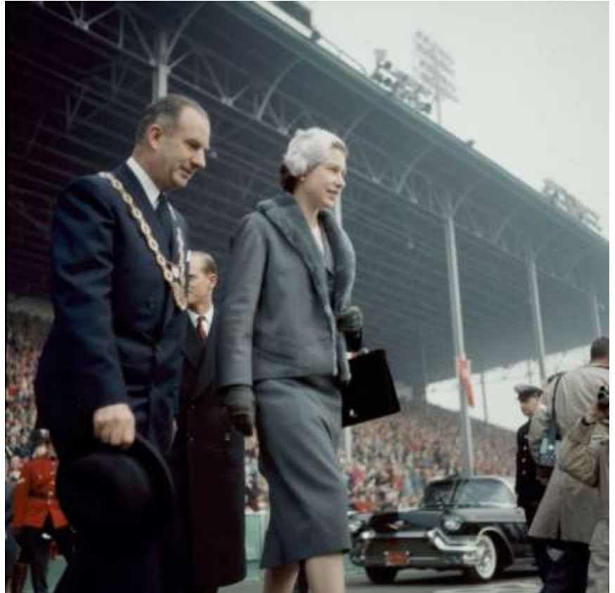
Queen Elizabeth II preparing to address the crowd with another 1957 Cadillac nearby

I tried not to get too excited (almost impossible), and wanted to make sure they were real. I compared the picture to the 1951 plate (owned by Pierre Delacote) which happens to be well documented on Christopher Garrish's BC plates website, and also did a Google image search to see if the 1957 plates were pictured anywhere. As luck would have it, Library and Archives Canada had some nice full colour pictures online of the visit, complete with a close-up of the car when the Queen landed at Canadian Forces Base Uplands. After reviewing all of this evidence, I knew they were real!