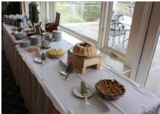
Plenty of desserts to enjoy