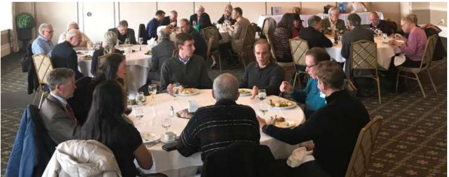
Great food, great conversation!

Visit us on the web! www.clcpotomacregion.org