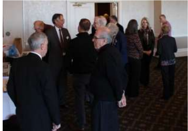
Attendees enjoying the camaraderie