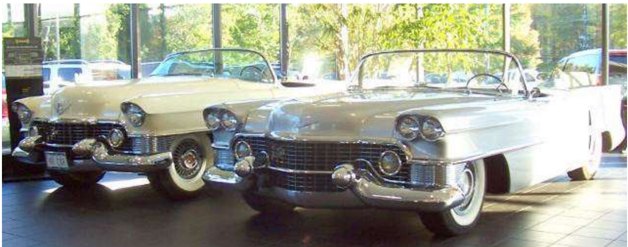
Both remaining 1953 Cadillac LeMans' (#3 left and #4 right) together for the first time ever!