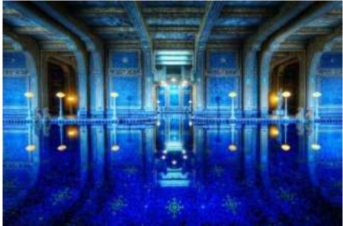
Indoor Roma Pool

Totally exhilarated, and somewhat exhausted, by our tours of the Castle, we left in mid-afternoon to drive further up the coast on the Pacific Coast Highway. One notable destination