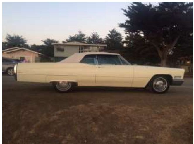
Alan Clark's '67 DeVille reflected in the sunset