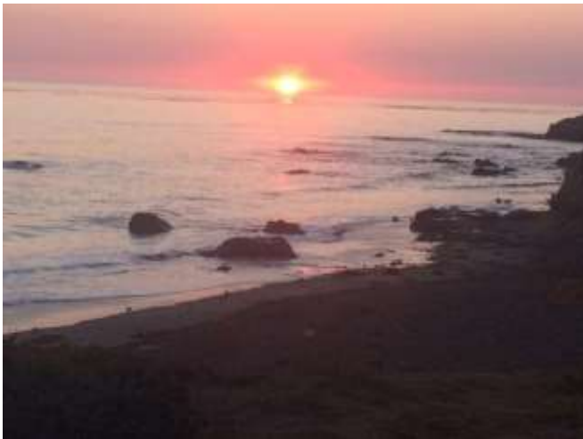
Sunset at Cambia Beach

I have to say the drive on the PCH in the central California coast is interesting. There are a number of stretches where you can go 55 MPH on the single lane road. We encountered some truly crazy drivers on these sections. At one point, I was going 65 MPH up a hill and a big Mercedes SUV passed me on a double line near the top of the hill. I pulled off to let him by. Thankfully nobody was coming the other way! On the return back to San Luis Obispo, we decided to take Highway 101, which hugs the coast but drives as a freeway at 65-70 MPH, which Alan's car handled with ease.