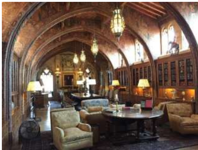
One of the meeting rooms in Casa Grande at Hearst Castle

Totally exhilarated, and somewhat exhausted, by our tours of the Castle, we left in mid-afternoon to drive further up the coast on the Pacific Coast Highway. One notable destination