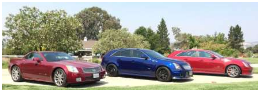
A rare sight – three limited edition modern V-cars participating in the tour