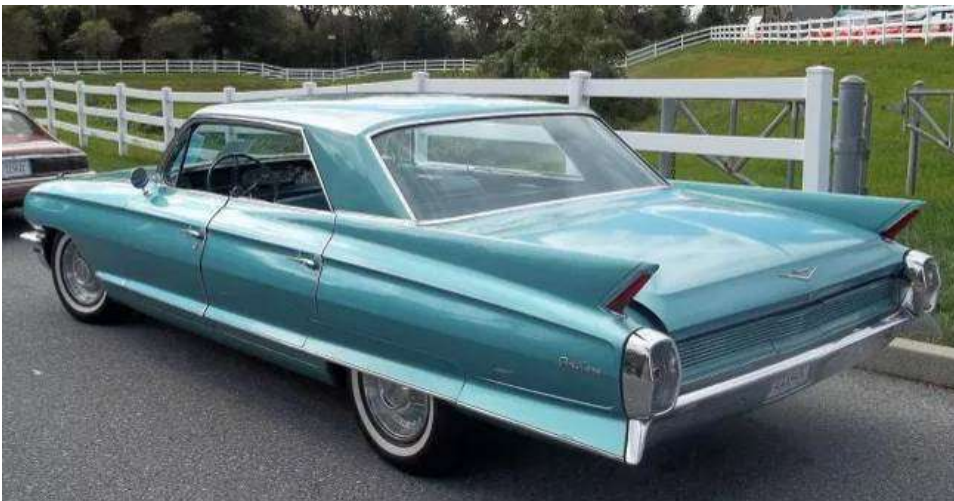
Joe Palmore's 1962 Park Avenue for sale at the Hershey Car Corral

Always the first day of Hershey and walking the fields usually translates into being very tired and exhausted. It's the combination of arriving and wanting to see all the different fields. Even at 8:00 am there is a feeling of excitement and anticipation with the crowds of people leaving their hotel parking lots for the Hershey fields. Around lunch time, the aroma of the food and the outdoor stands are bound to excite your taste buds and make you want to sample all the delicious eats from perogies to crab cake sandwiches. It is a lot of fun and the food is very, very good. There is nothing else like it anywhere.