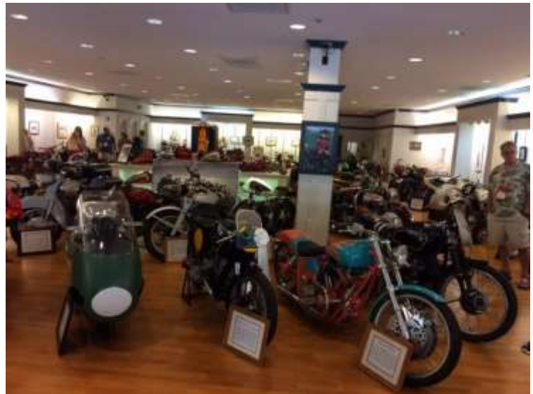
The Solvang Vintage Motorcycle Museum contained great examples of the rarest marques

Our first stop was the Solvang Vintage Motorcycle Museum. If you are any kind of a vintage motorcycle buff, the names Crocker, Norton, Vincent, and Brough represent the Holy Grail marques of the two-wheel set. The Solvang Museum didn’t disappoint, with concours examples of these rare bikes. For example, three Vincent Black Lightnings (only 30 were built) were on display. Solvang has 10% of their entire production! The Los Angeles-made Crocker represented a very rare bike with only about 200 produced in the 1930’s until production ceased in 1942. Suffice it to say, it was amazing to see beautiful examples of these very rare motorcycles in one place.