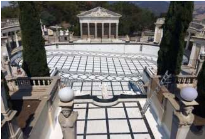
Outdoor Neptune Pool