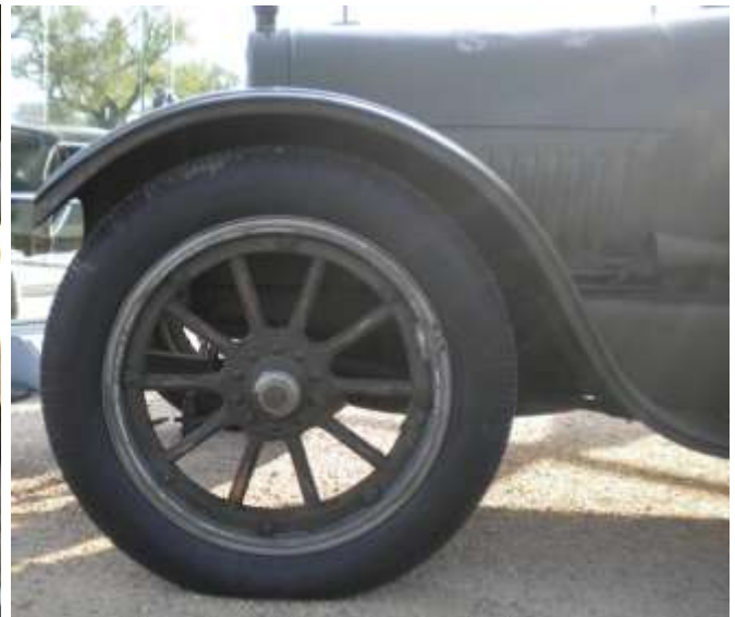
A few more photos of the 100-year-old Cadillac