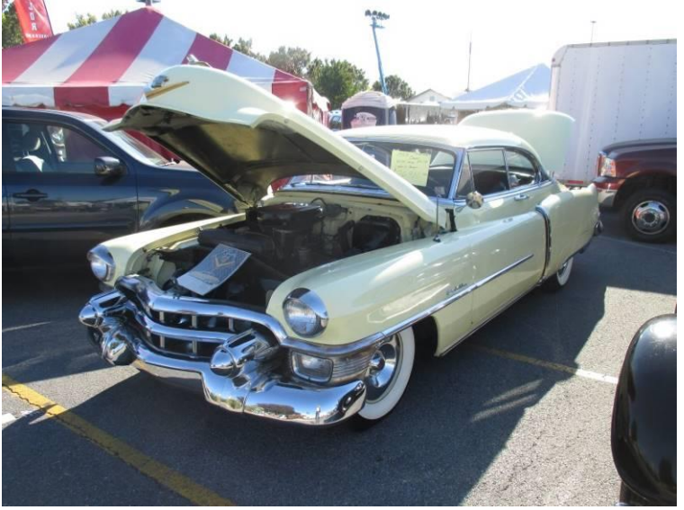
[upper left] This 1980 Sedan deVille, listed for $8,900, was parked behind a vendor's tables in the Flea Market Chocolate Field. [lower left] In the Flea Market Red Field was this 1953 Fleetwood 4-door sedan for $21,500. [above] Also tucked away in the Chocolate Field was this "one family owner" 1953 Coupe deVille for $21,900.