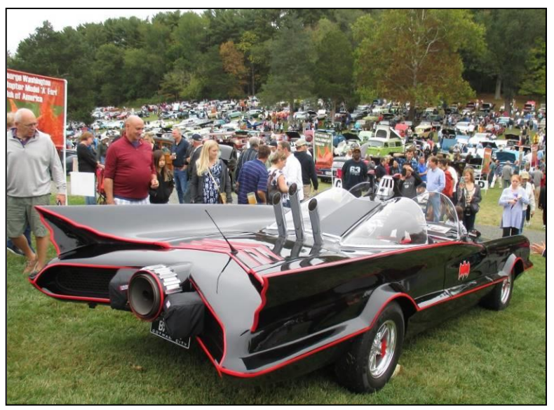
Despite being parked on the hill near the children's' playground, it drew more attention from adults than children.

The City of Rockville follows the guidelines of the Antique Automobile Club of America by requiring that show entrants must be vehicles that were manufactured at least twenty-five years prior to the show. Also, Rockville requires that all vehicles must be in a condition of preservation or restoration that would not reflect discredit on the show or hobby. Further, the City does not admit replicars, hot rods, custom/modified cars or any other nonauthentic or altered vehicles to the display field. However, this year an exception was made for the locally-owned and everpopular Batmobile replica, modeled after the car which debuted in the TV series in 1966. This Batmobile has a fiberglass body mounted on a 1978 Lincoln chassis.