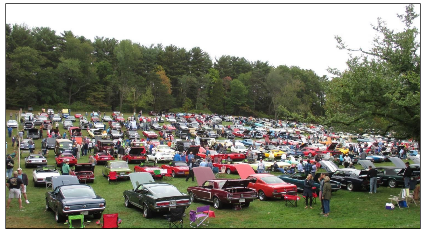
This is a partial view of the huge show field. This photo was taken before all of the vehicles had been assembled on the show field and before the show field was open to the public.

In the early hours of Saturday, October 14, 2017, just when many classic car owners were getting ready to drive to Rockville, there was a dense mist throughout much of the Washington, DC Metropolitan Area. It's likely that this weather may have kept a few cars home in their garages. Nevertheless, just over 500 cars did participate in the City of Rockville's annual car show. So despite the damp gray skies, the picturesque grounds of the historic Glenview Mansion in the Rockville Civic Center Park held an exceptional collection of cars, trucks and other vehicles.