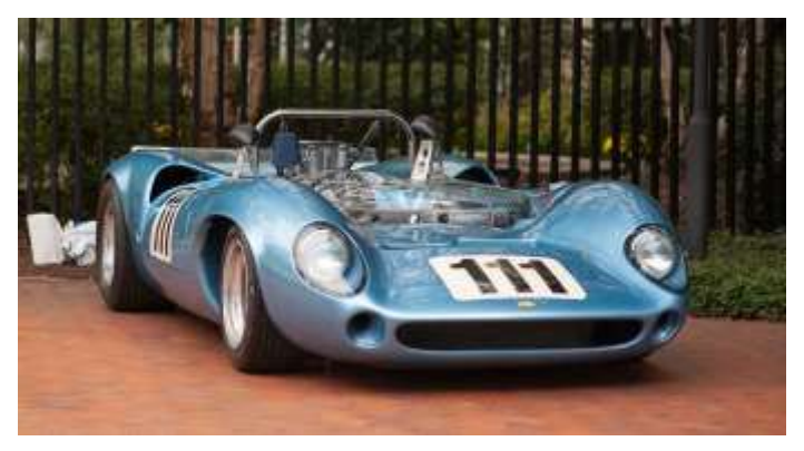
1965 Lola T70 Mk VI with 715 hp. It really woke up the neighborhood.