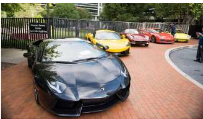
European sports car section