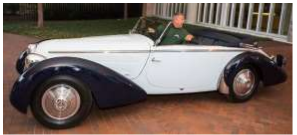
This very special '38 Talbot Darracq is one of two in the world. It came from a very significant collection and then returned to its home base in New York.