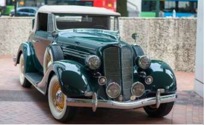
Jack Gallagher brought his beautiful '35 Buick Convertible Coupe.

To view more pictures, visit <a href="http://www.clcpotomacregion.org/2016velocitychannelcarshow.htm">http://www.clcpotomacregion.org/2016velocitychannelcarshow.htm</a>.