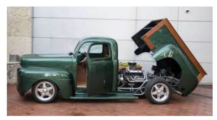
This is a GT40 with a 48 Ford pickup truck built up on top. The ultimate sleeper.