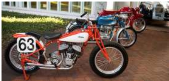
This is the only surviving '40 Indian prototype track bike of four originally built.