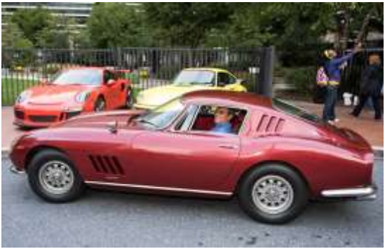
1965 Ferrari 275 GTB short nose