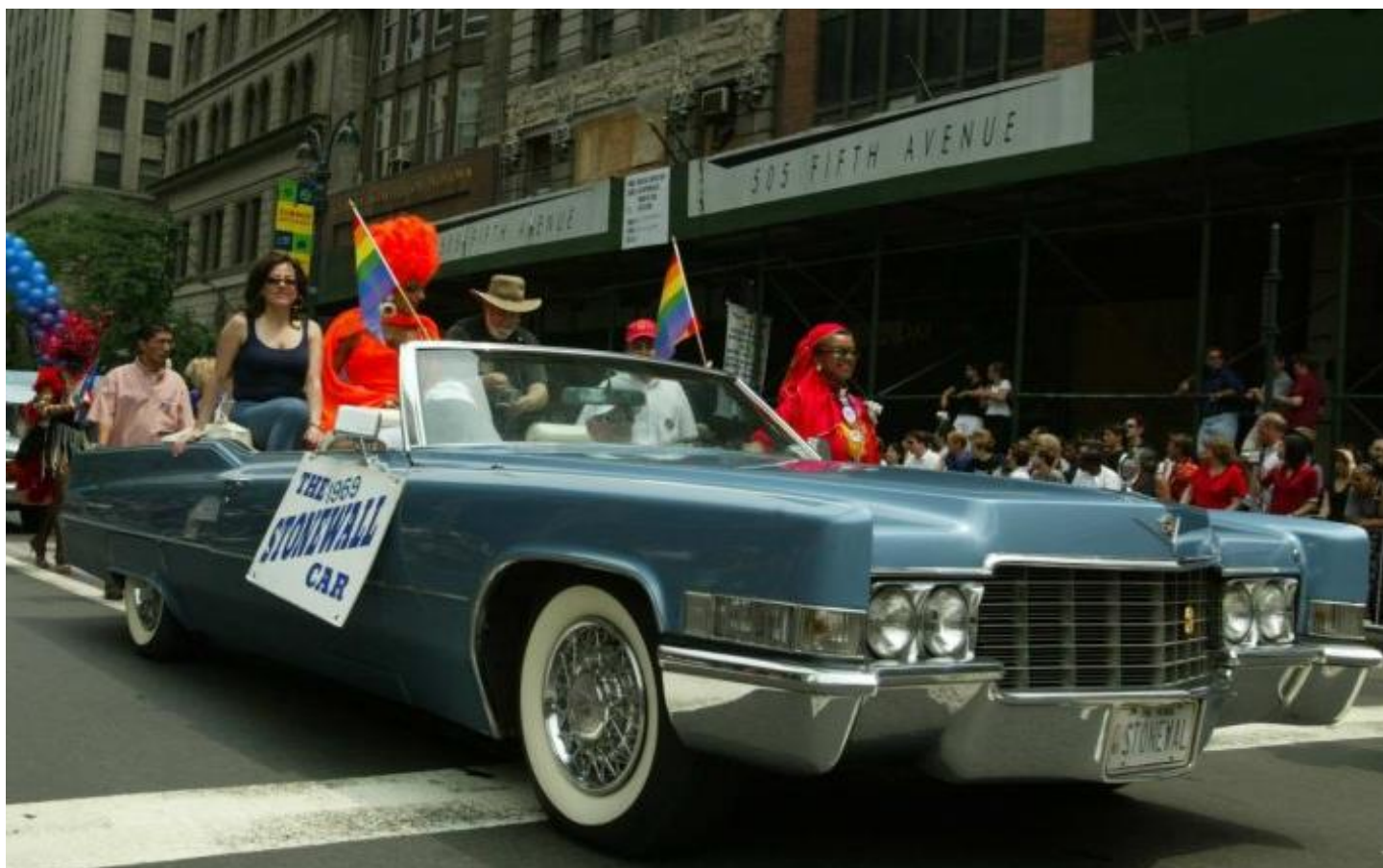
The Stonewall Cadillac leading the New York City Gay Pride Parade June 2003