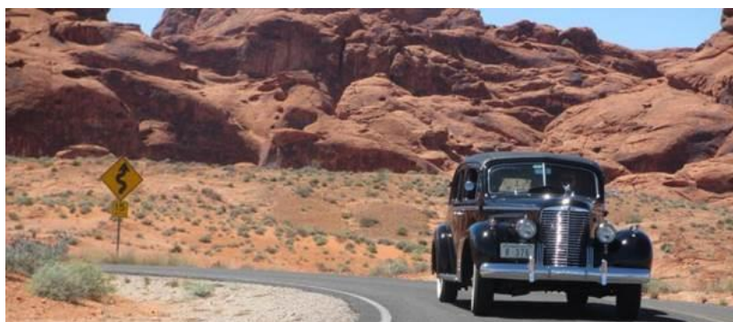
A 1938 V-16 driving through the Valley of Fire