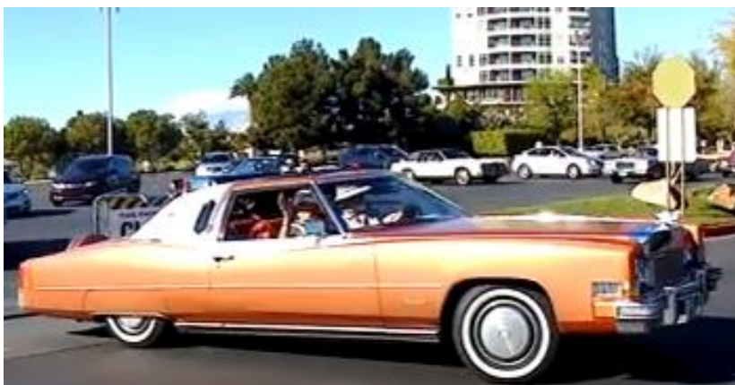
The '74 Eldo "pimpmobile" leaving for the Valley of Fire driving tour