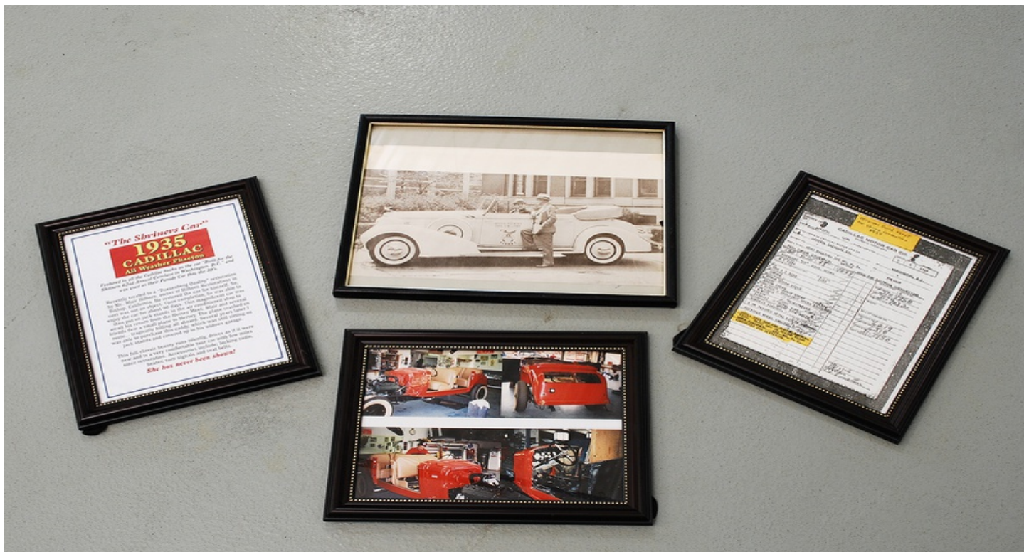
L to R: "The Shriner's Car", build sheet and pictures of the restoration

Wonderfully finished and equipped, the car wears bright red paint over a tan leather interior, and rides on beige wheels with red wheel discs and whitewall tires. Dual enclosed sidemount spares are mounted with a mirror each, while Super 8 spotlights can be found up front and a folding luggage rack in back. The front and rear doors are joined in the center of the car by huge, fabulous chrome hinges, and the unique rear fender skirts incorporate a faux chrome hubcap into their design. The interior is just as lavish with a heater, radio, restored gauges, sun visors, banjo steering wheel, cigarette lighter mounted in the back of the front seats, and a robe rail. After a fully photo-documented ground up restoration, this car's presentation is absolutely stunning. The paint, chrome, interior and details are all exquisite. A CCCA Full Classic, it would be more than at home on a competitive concours field or on a parade route. Sold by Hyman Classic Cars in 2014, look for this car at future Cadillac & LaSalle Club events!