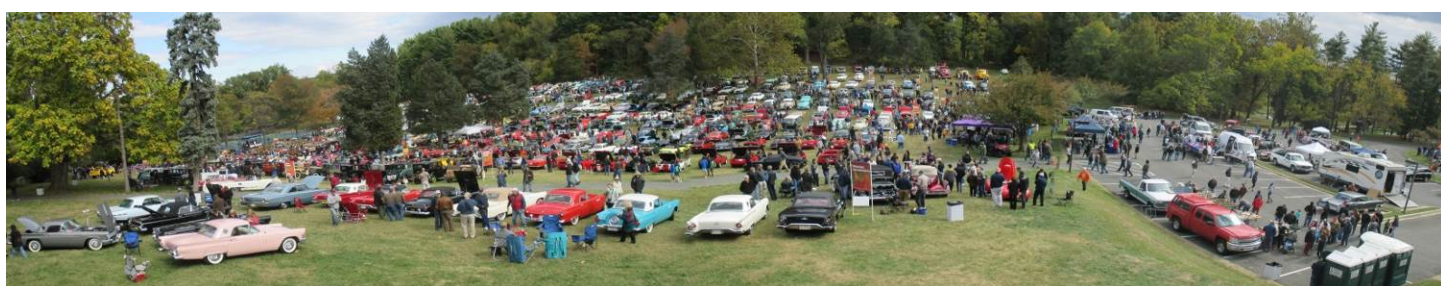
This panoramic view from the hill on the Glenview Mansion side of the park captures just part of the huge show field (left & center) and the vendor/car corral area (right)

The City of Rockville's annual car show continues to be the premier non-judged motor vehicle show in the Greater Washington, DC Metropolitan Area. On Saturday, October 17, 2015, a fantastic number of cars, trucks and other vehicles, 582 to be exact, were assembled on the picturesque grounds of the historic Glenview Mansion in the Rockville Civic Center Park. This was a new record for vehicles on display on the show field in the show's fifty-three year history.