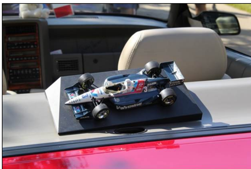
Model of winning Al Unser Jr's 1993 Indy 500 racecar