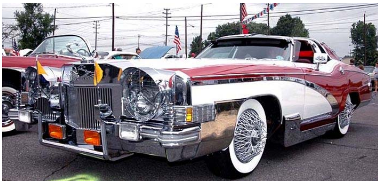
The Les Dunham Corvorado

Visit www.clcpotomacregion.org/eventslisting.htm where show flyers can be downloaded.