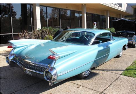
Sandy Kemper's 1959 Coupe DeVille