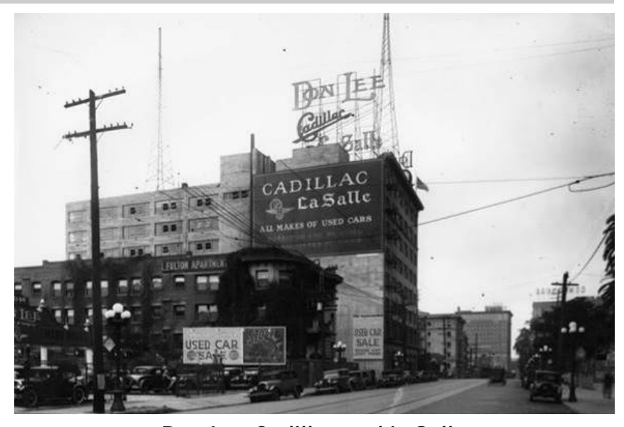
Don Lee Cadillac and LaSalle Circa 1930

The cars are 1930 Cadillac V-16s. On the left is a Series 4335 convertible coupe, a two-passenger car with room in the rumble seat for two additional folks who like fresh air. Next to it is a Series 4130 Madame X Imperial sedan, and an early one, too, since it has the nearly upright, split windshield, instead of the one-piece, dramatically raked windshield. Madame X cars had enhanced styling features and cost $1,000 more than their non-Madame X counterparts. The limousine has two-sided whitewall tires, while the convertible coupe's