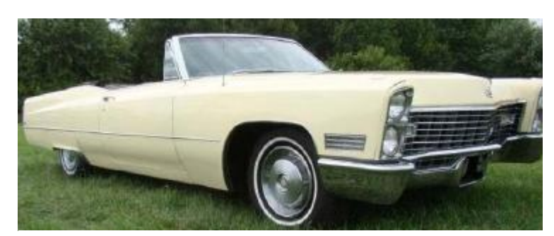
1967 DeVille Convertible in excellent condition

443-871-0232 or <a href="mailto:lowesautomotive@verizon.net">lowesautomotive@verizon.net</a>