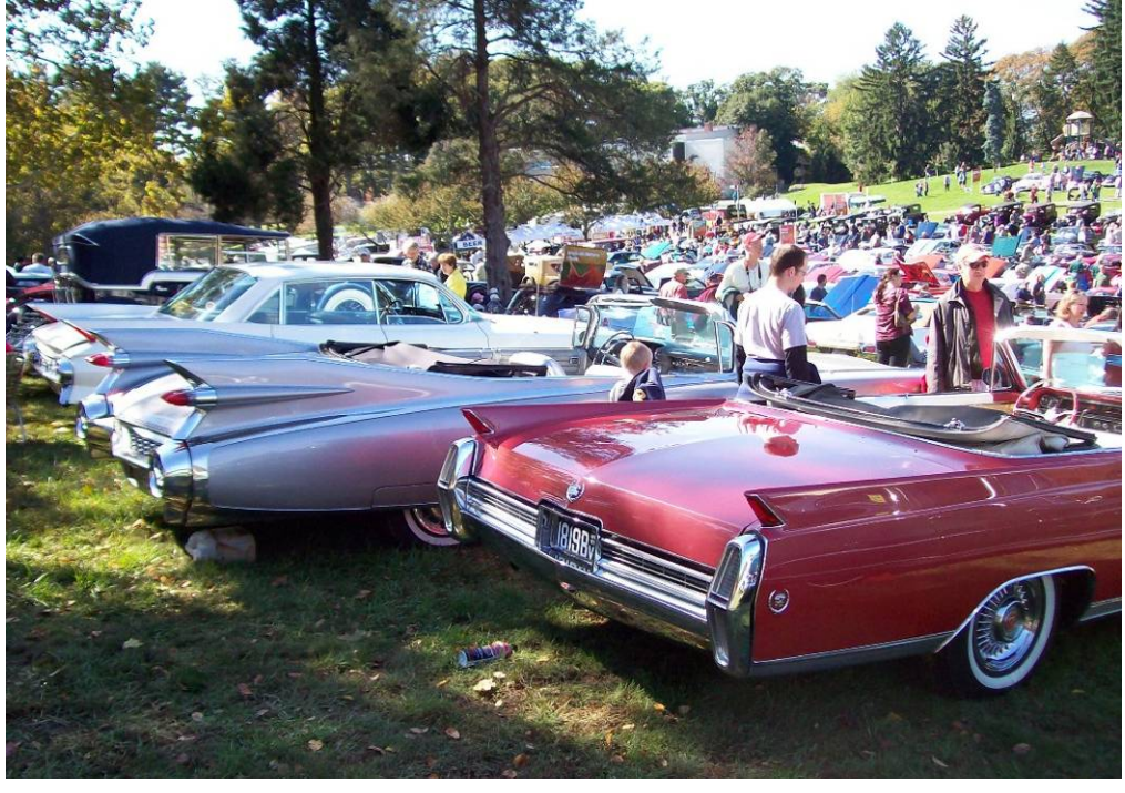
Cadillac row - front and rear!