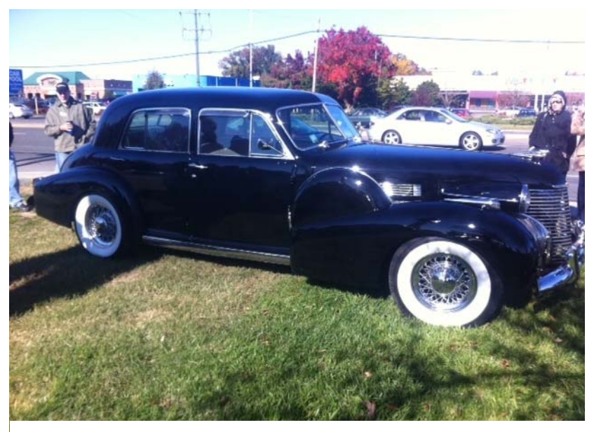
This rare 1940 Series 60 Special sported a division window, dual side mounts, and a 305 Chevy small block V8.

CENTRAL VA REGION CAR SHOW MOORE CADILLAC RICHMOND VA STORY & PHOTOS BY CHUCK PIEL