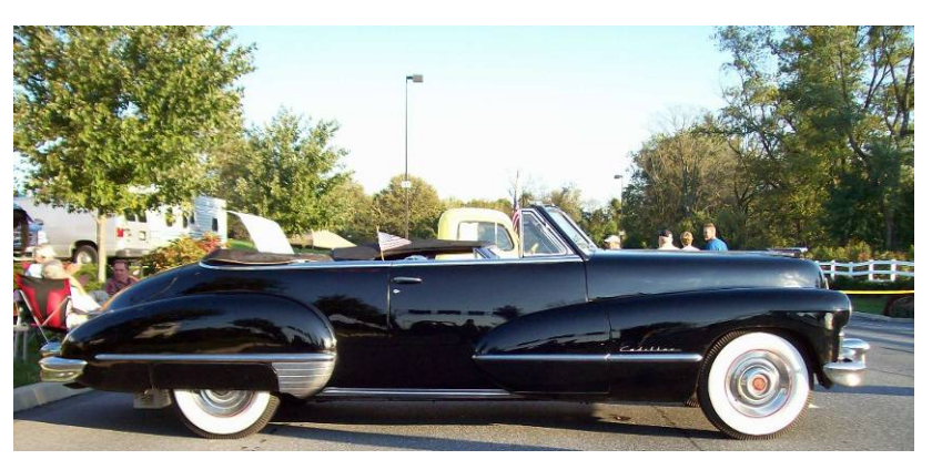
A beautiful 1947 Convertible Coupe for sale

And it has taken place in early October since 1955. In recent years, the AACA Fall Meet at Hershey has featured over six thousand flea market vendors, hundreds of cars for sale in the car corral and over a thousand cars in the judged car show.