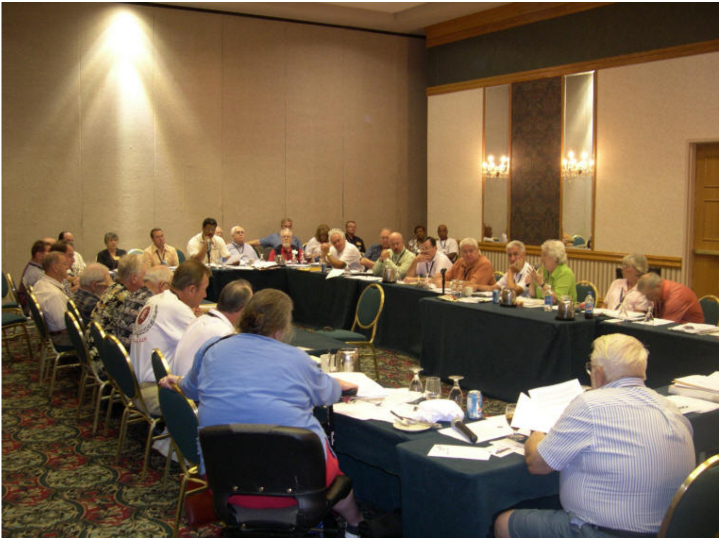
The CLC Board hard at work

2007 CLC SUMMER BOARD MEETING STORY BY BILL SESSLER