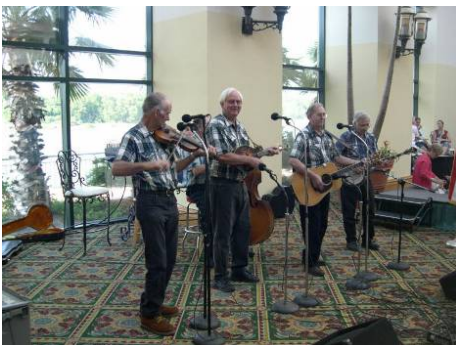
Band at the Welcome Reception