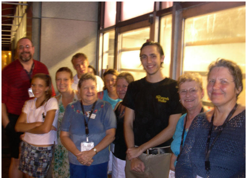
Drenched Ghost Tour Group!