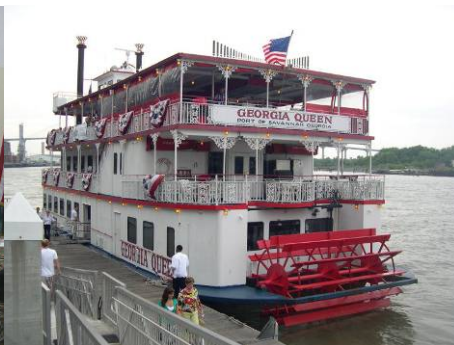
Georgia Queen Dinner Boat