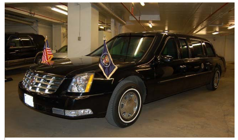
The limo majestically displays its flags

The vehicle interior boasts seating with comfort and visibility for all occupants. A rear seat executive package features a concealed, foldaway desktop that can be deployed when conducting affairs of state. The rear seats have an adjustable reclining feature along with the adaptive seat system, which senses the position of the occupant in the seat and automatically adjusts the cushion for added comfort. Wood accents, rich blue leather and cloth complete the executive interior.