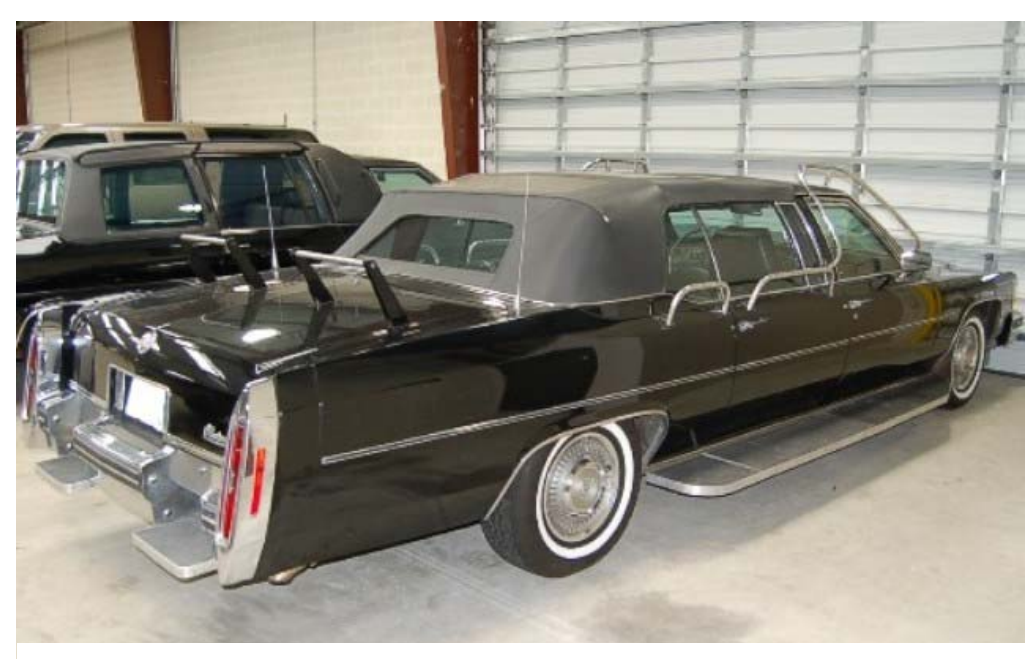
Out-of-service Cadillac Limos used for training